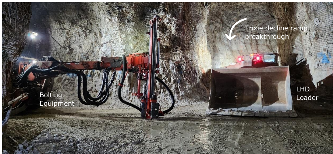
Figure 1: Breakthrough of the Trixie Brandy Lee decline to 625 ft. level achieved in September 2023